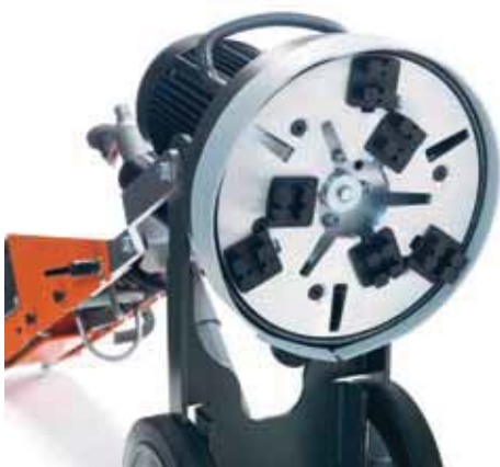
Single grinding plate with multiple diamond tool distribution positions.