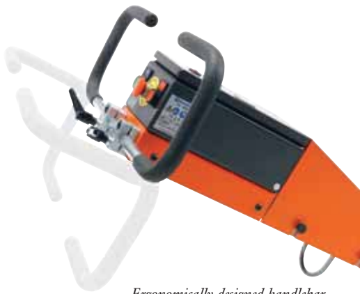
Ergonomically designed handlebar.