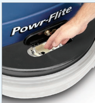
Easy access for brush removal

Independent dual wheel traverse motor drive. Differential drive motor with lifetime lubrication