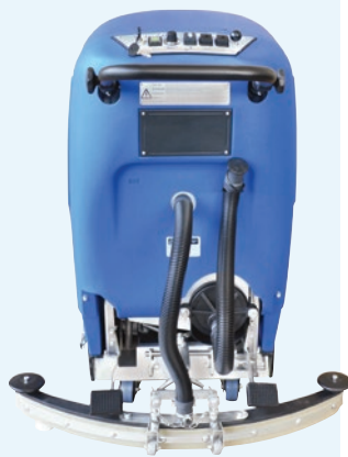
Solution control located at finger tips. Brush and squeegee lower with foot pedals