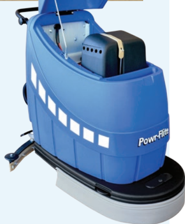
Simple access to batteries, vacuum motors and tanks

Independent dual wheel traverse motor drive. Differential drive motor with lifetime lubrication