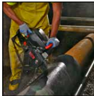
Safer to cut ductile iron