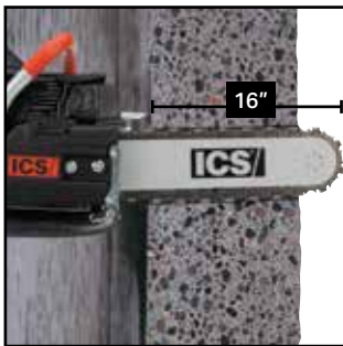
Deep cutting solution for obstructed or small openings