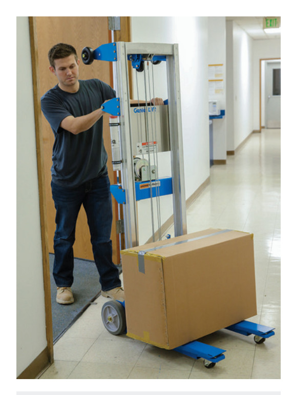
Material Handling Attachments